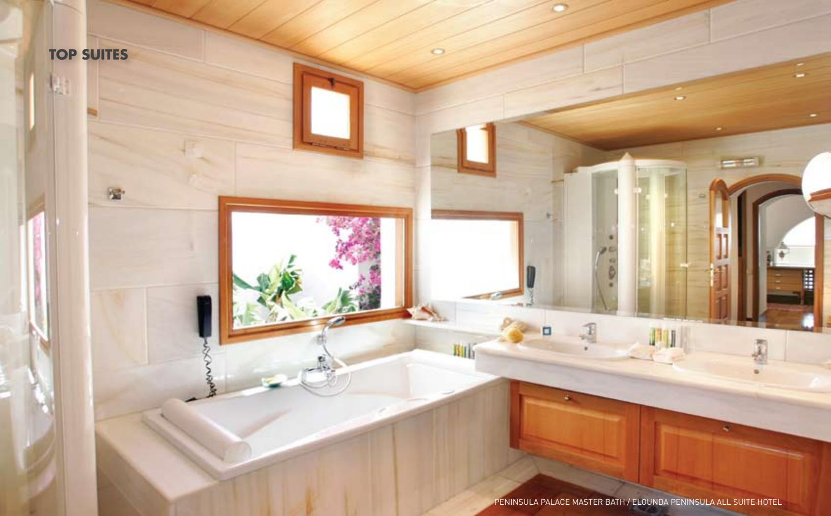
PENINSULA PALACE MASTER BATH / ELOUNDA PENINSULA ALL SUITE HOTEL