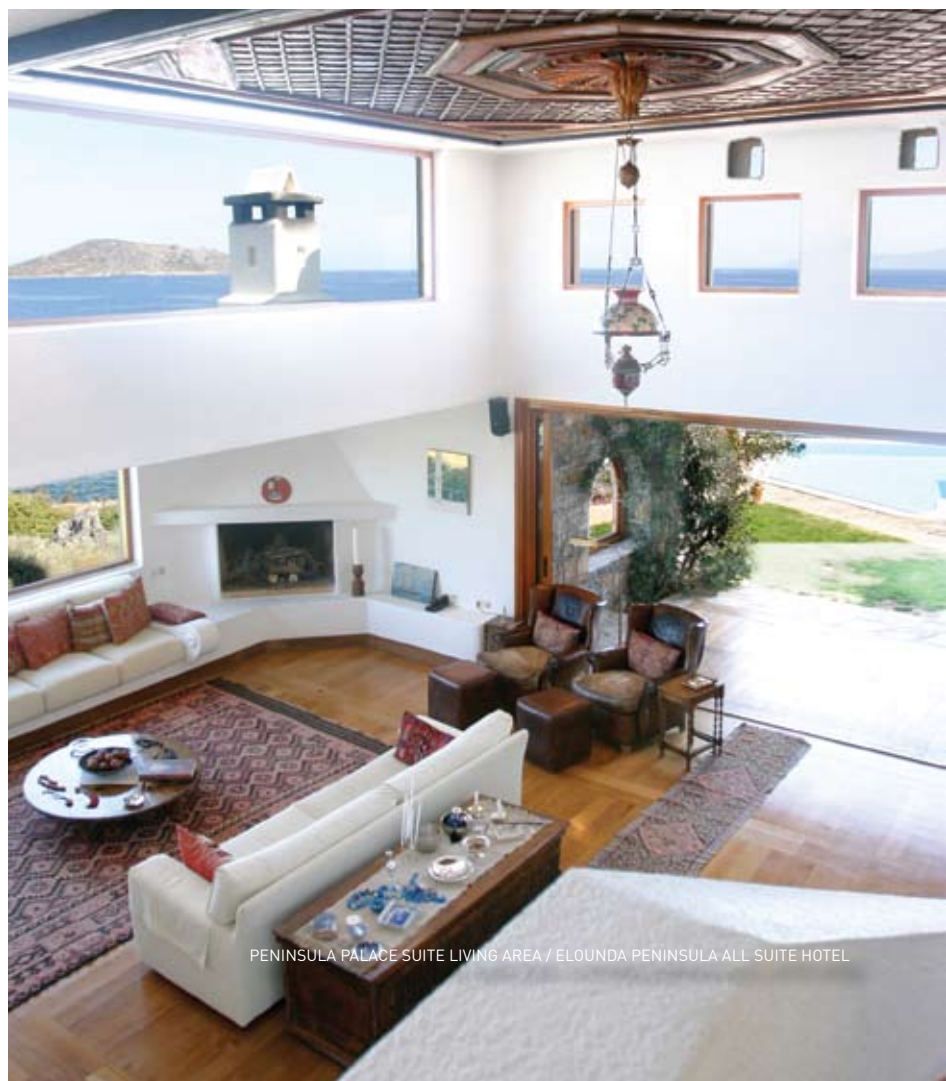
PENINSULA PALACE SUITE LIVING AREA / ELOUNDA PENINSULA ALL SUITE HOTEL