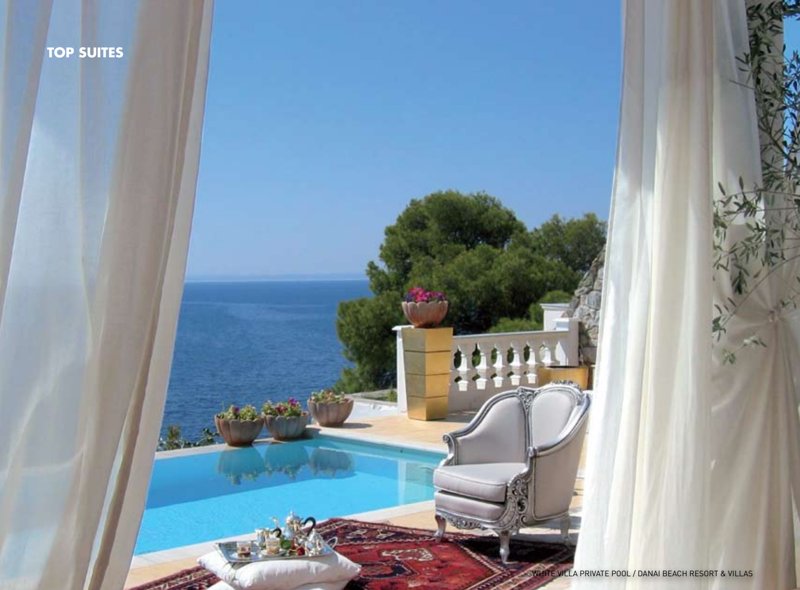
WHITE VILLA PRIVATE POOL / DANAI BEACH RESORT & VILLAS