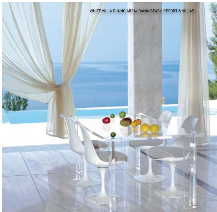
WHITE VILLA DINING AREA / DANAI BEACH RESORT & VILLAS