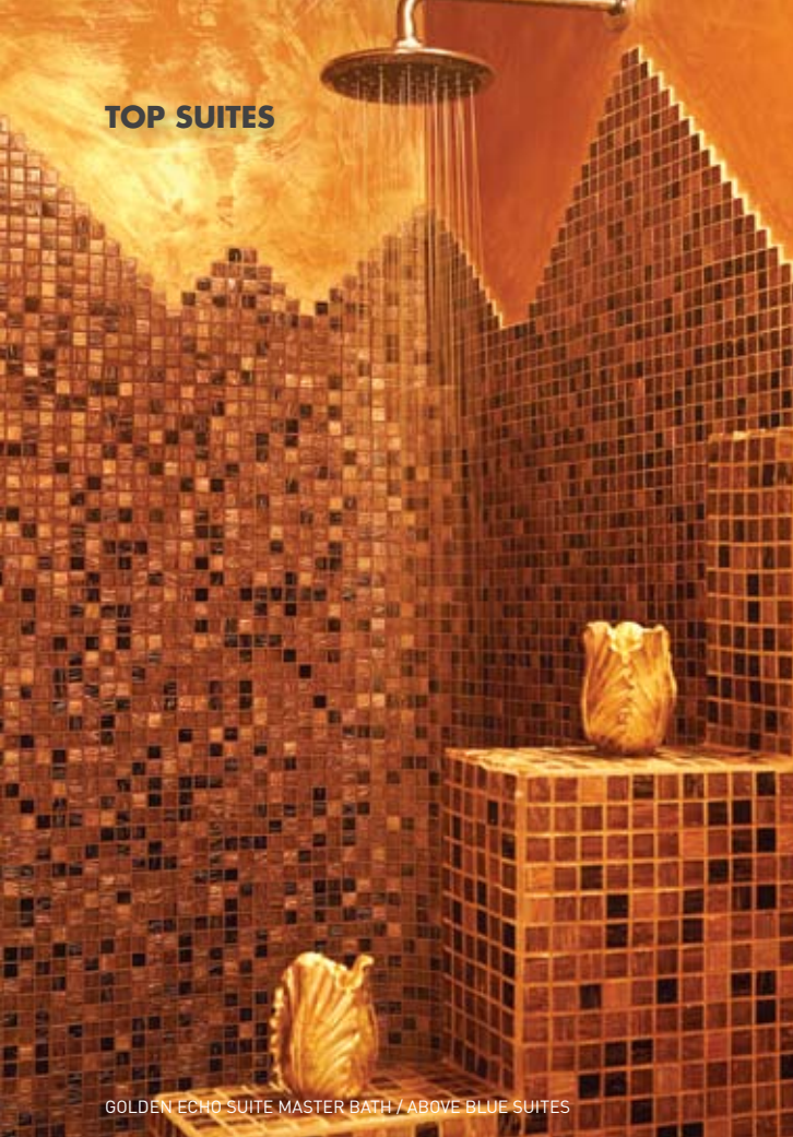
GOLDEN ECHO SUITE MASTER BATH / ABOVE BLUE SUITES