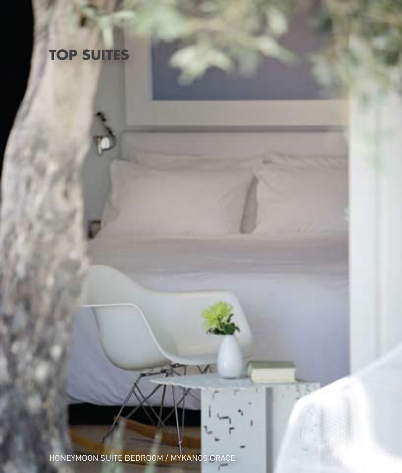
HONEYMOON SUITE BEDROOM / MYKONOS GRACE