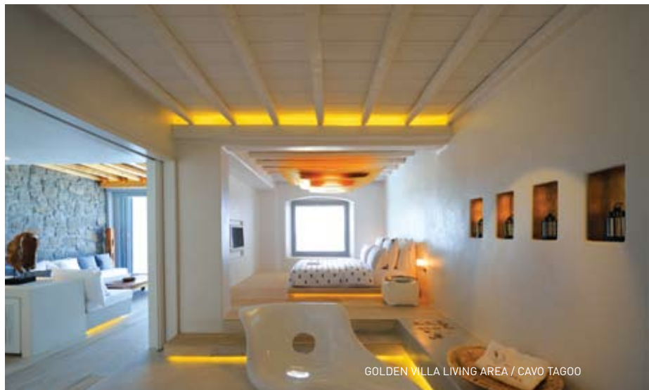
GOLDEN VILLA LIVING AREA / CAVO TAGOO