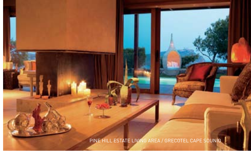
PINE HILL ESTATE LIVING AREA / GRECOTEL CAPE SOUNIO