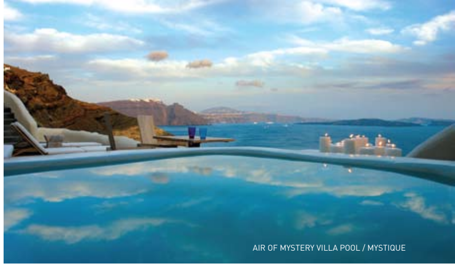
AIR OF MYSTERY VILLA POOL / MYSTIQUE

862; george@grafakos.gr; www.abovebluesuites.com