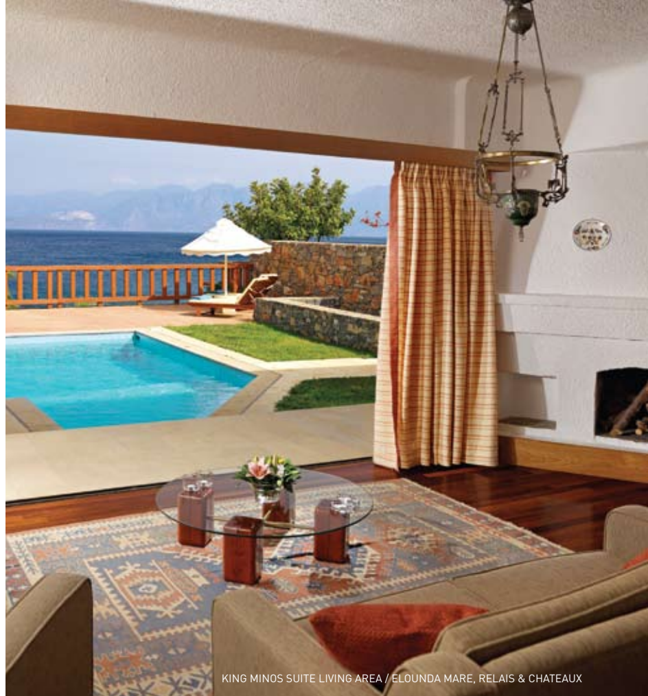
KING MINOS SUITE LIVING AREA / ELOUNDA MARE, RELAIS & CHATEAUX