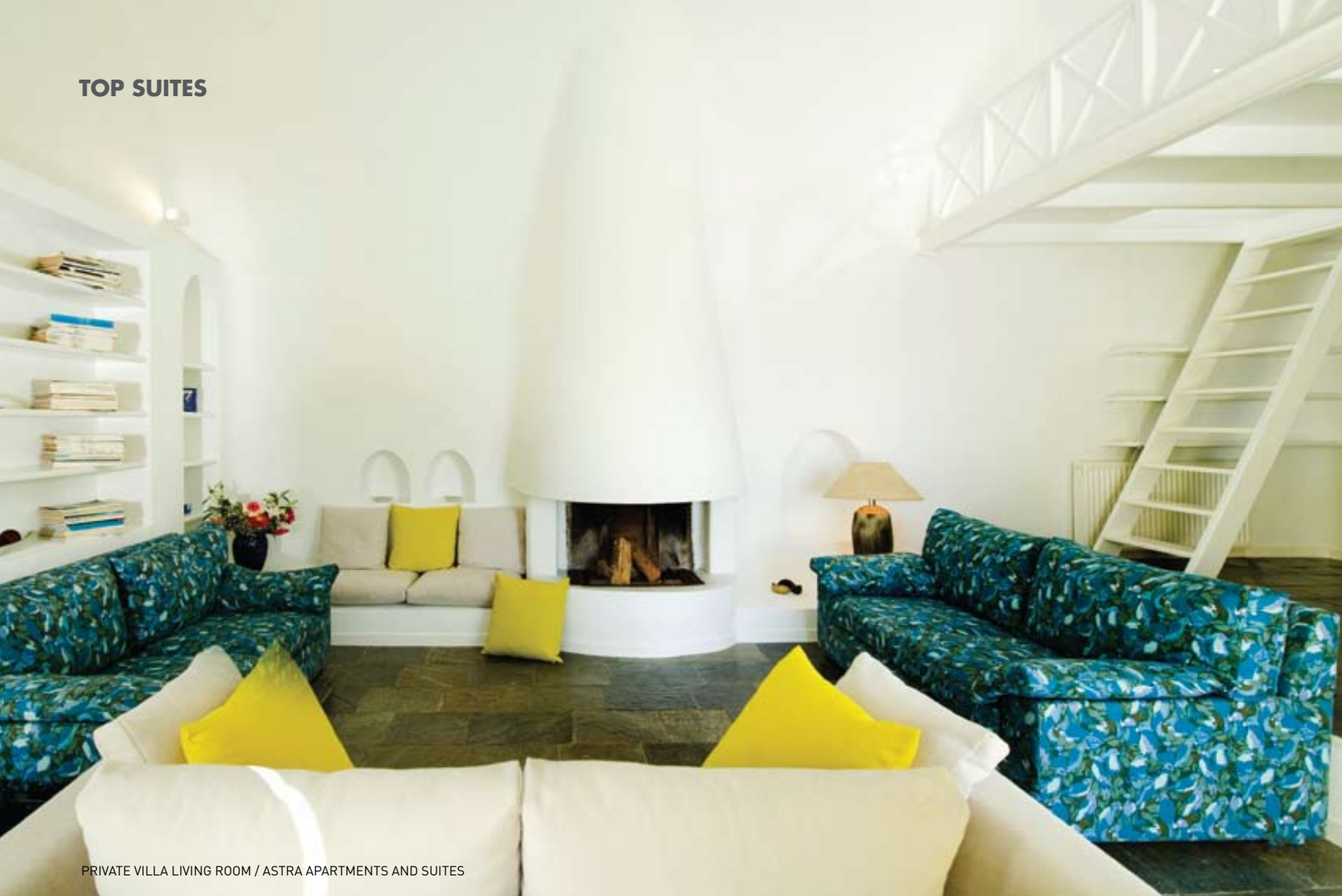
PRIVATE VILLA LIVING ROOM / ASTRA APARTMENTS AND SUITES