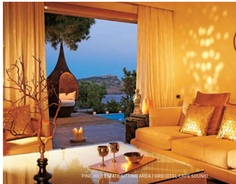
PINE HILL ESTATE SITTING AREA / GRECOTEL CAPE SOUNIO