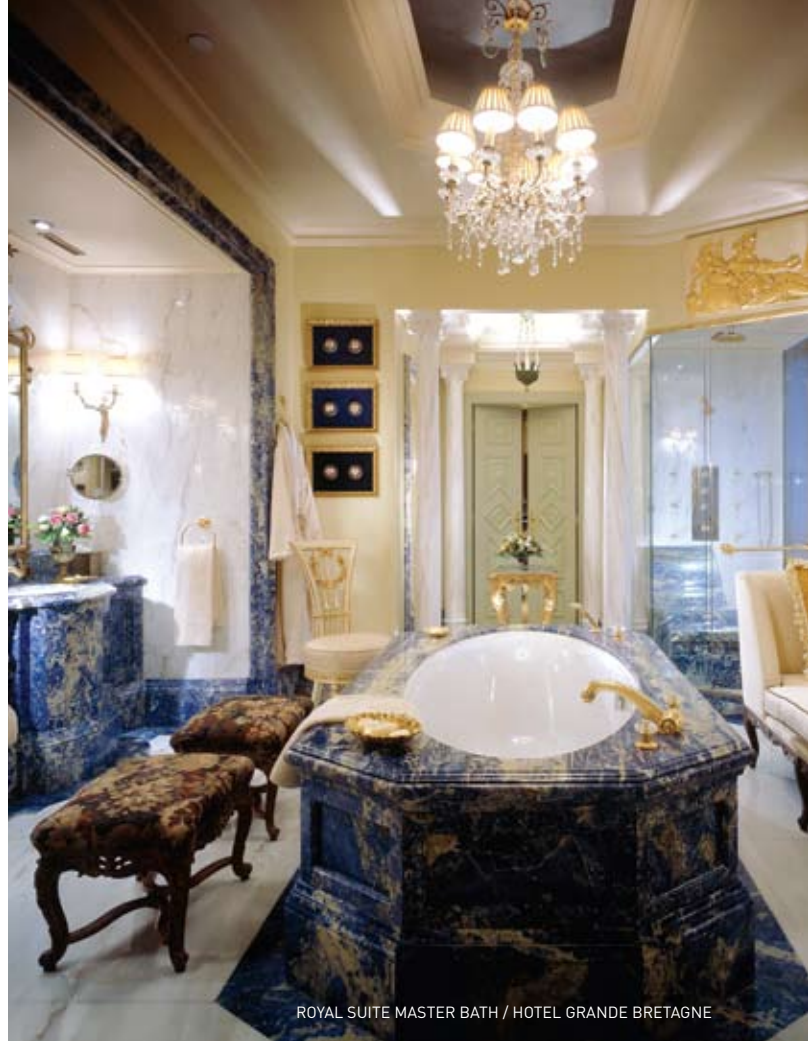
ROYAL SUITE MASTER BATH / HOTEL GRANDE BRETAGNE