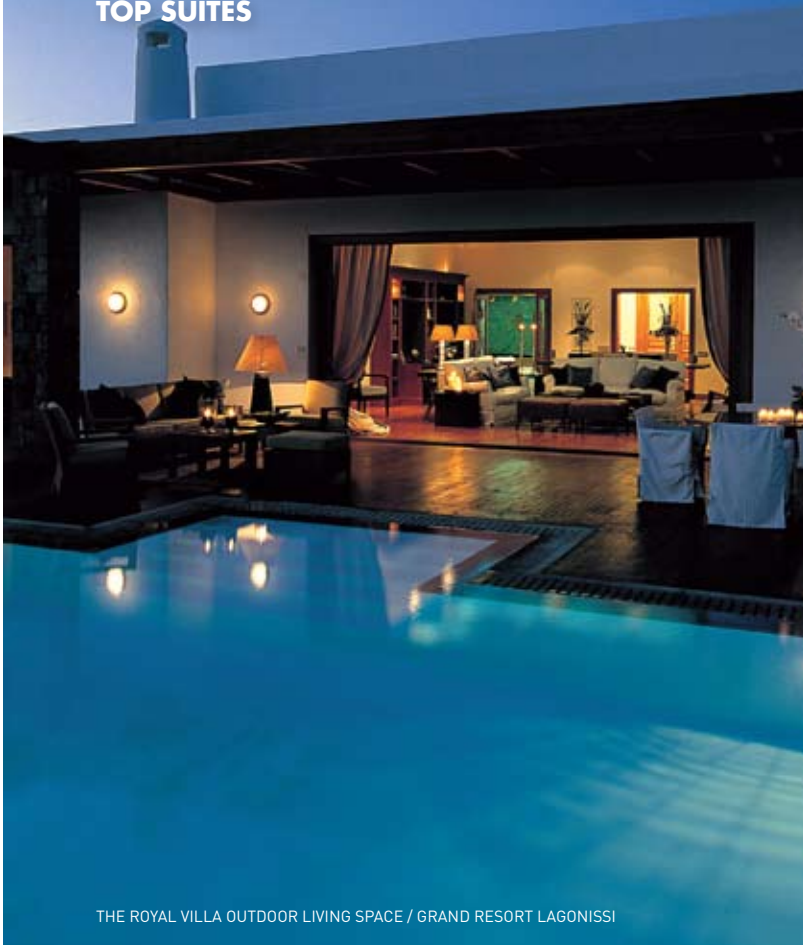
THE ROYAL VILLA OUTDOOR LIVING SPACE / GRAND RESORT LAGONISSI