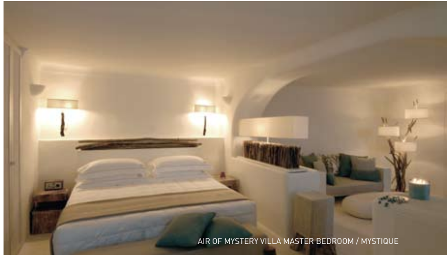
AIR OF MYSTERY VILLA MASTER BEDROOM / MYSTIQUE