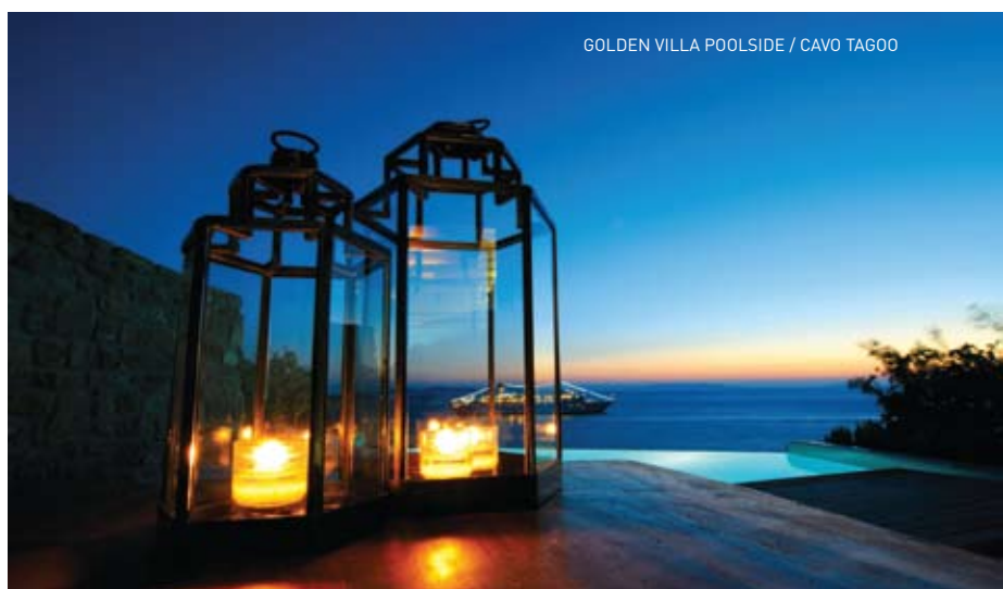
GOLDEN VILLA POOLSIDE / CAVO TAGOO