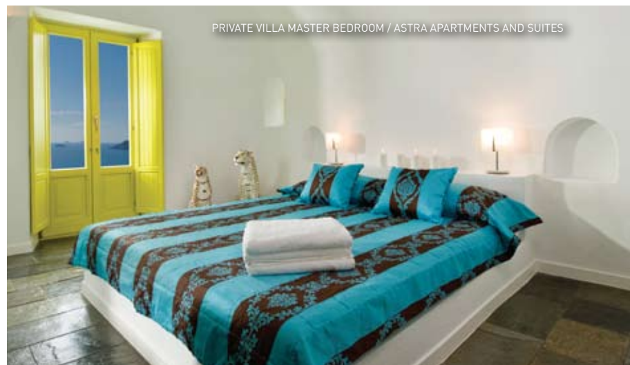
PRIVATE VILLA MASTER BEDROOM / ASTRA APARTMENTS AND SUITES