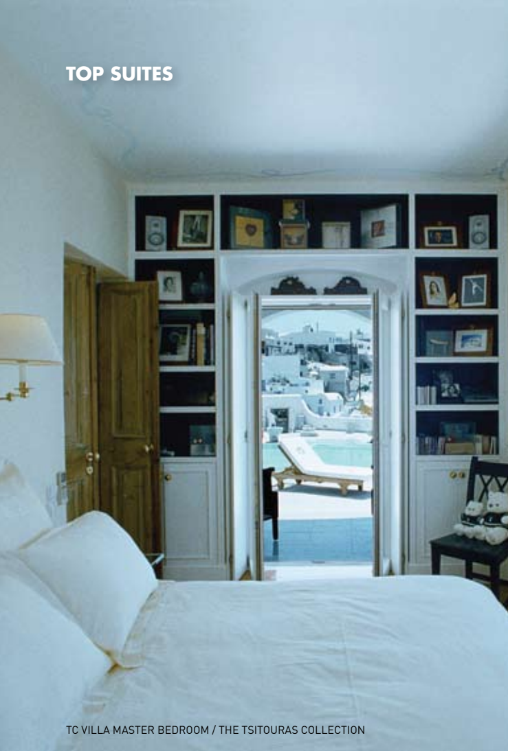
TC VILLA MASTER BEDROOM / THE TSITOURAS COLLECTION