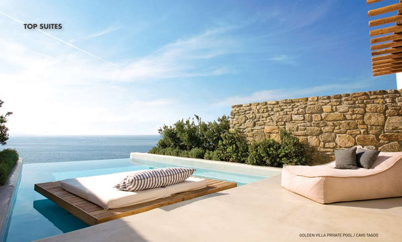
GOLDEN VILLA PRIVATE POOL / CAVO TAGOO