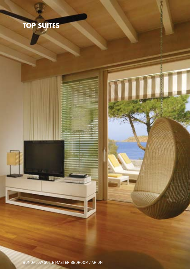
BUNGALOW SUITE MASTER BEDROOM / ARION