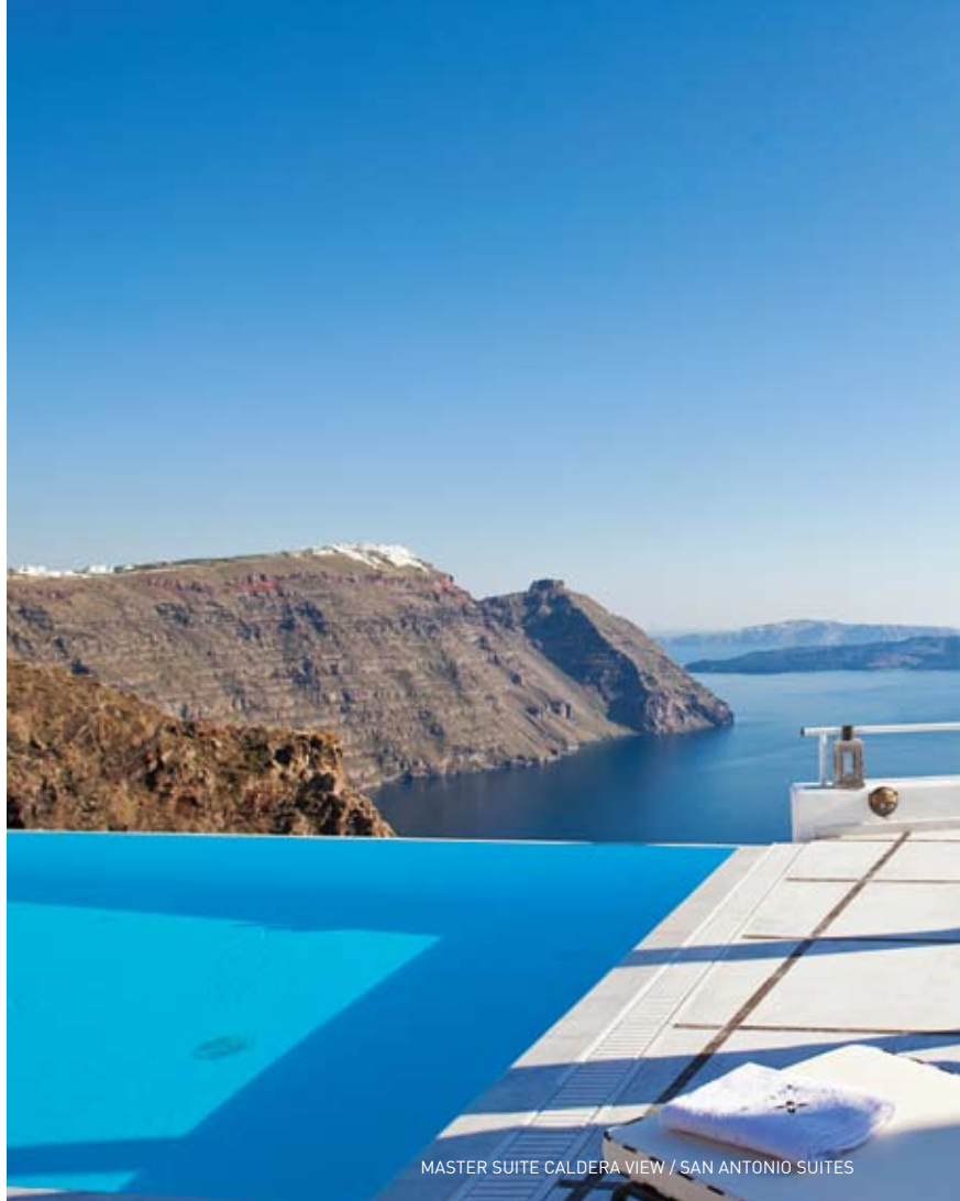
MASTER SUITE CALDERA VIEW / SAN ANTONIO SUITES