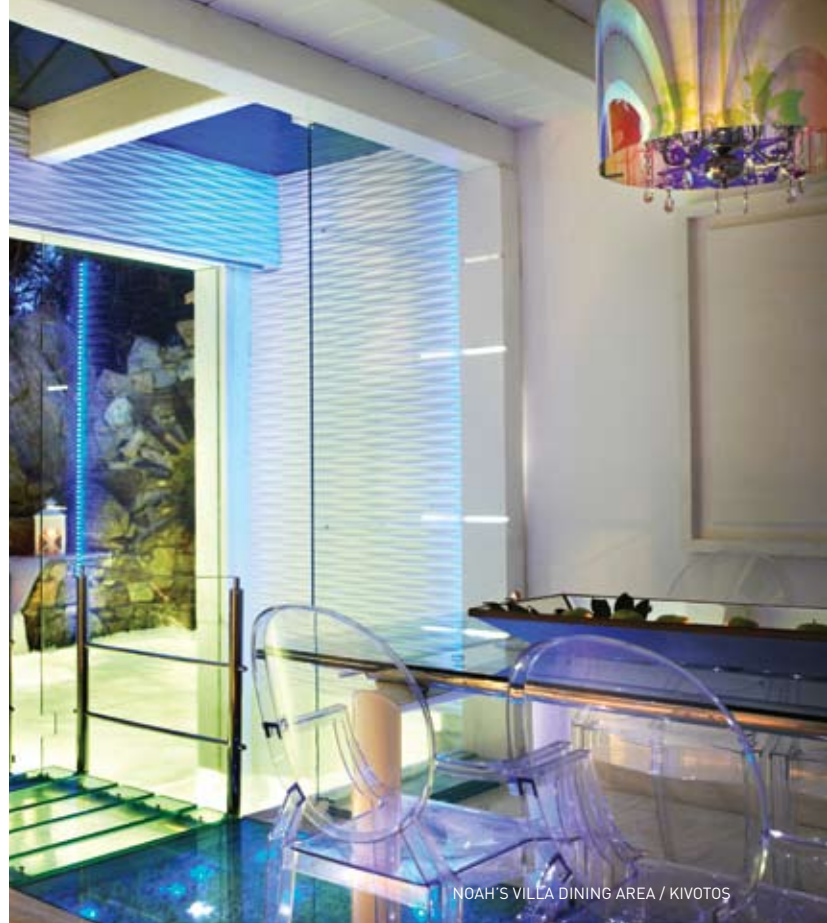
NOAH'S VILLA DINING AREA / KIVOTOS